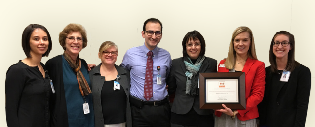
Partner in MS Care—Neurologic Care

The UNC Hospitals Neurology Clinic is a Partner in MS Care—Neurologic Care through the National Multiple Sclerosis Society. This formal recognition honors the clinic's commitment to providing exceptional, coordinated MS care. In addition, the clinic is a member of the Consortium of Multiple Sclerosis Centers and is listed as one of 250 centers in the US and Canada that provide comprehensive MS care.